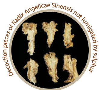
Decoction pieces of Radix Angelicae Sinensis not fumigated by sulphur

In general, herbal medicines that have been fumigated by sulphur would have a pungent smell and their colours would appear brighter. An overly pungent sour smell or bright colours may indicate the herbal medicines being excessively fumigated by sulphur. When in doubt, stop consuming and consult healthcare professionals.